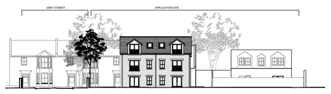
Street Elevation - View of New Build Flats