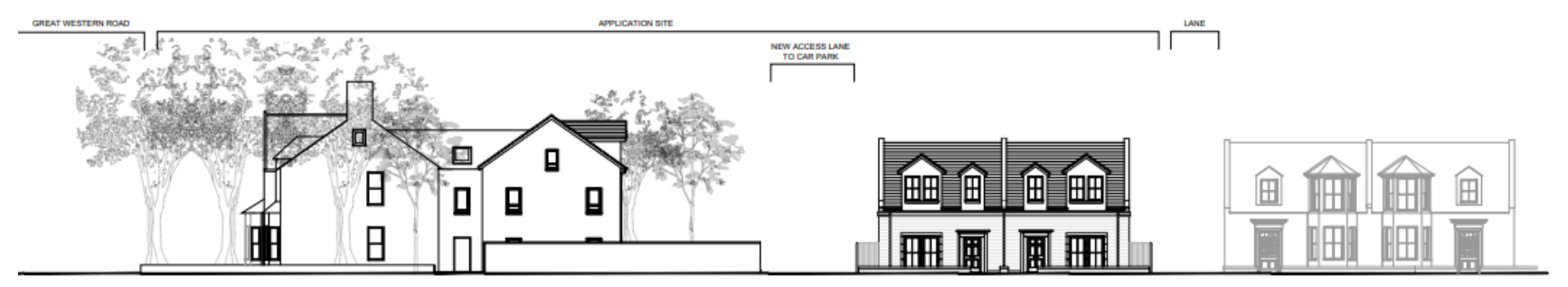
Street Elevation - Section through Gray Street